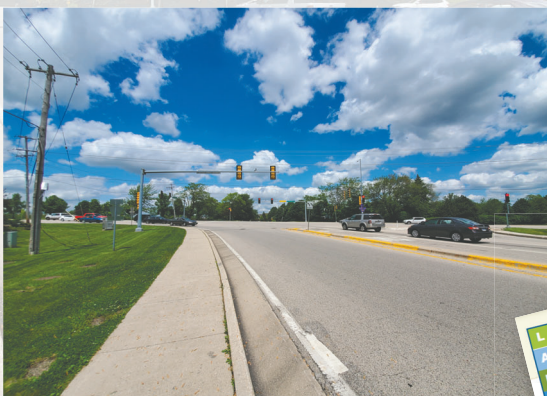
Looking west at Old McHenry Rd/ Quentin Rd